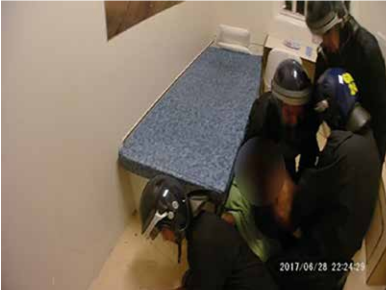
Figure 34: Use of force involving D1914

47. In my view, it was not in D1914’s best interests to be subject to a use of force in these circumstances. Indeed, it was positively harmful to D1914 and put him at further risk.