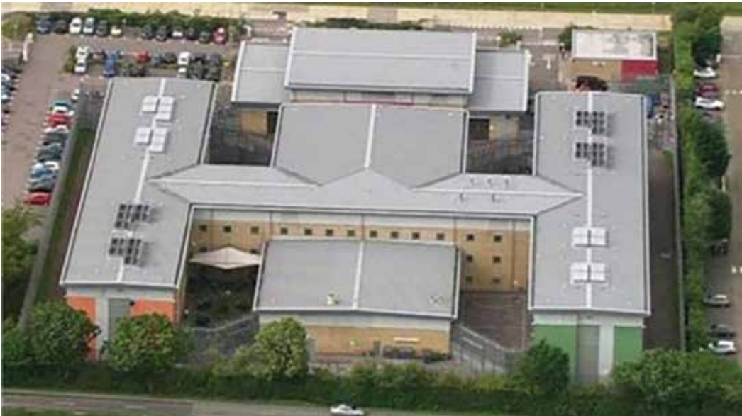
Figure 29: Aerial view of Brook House