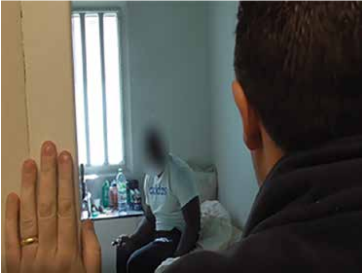
Figure 31: Cell at Brook House