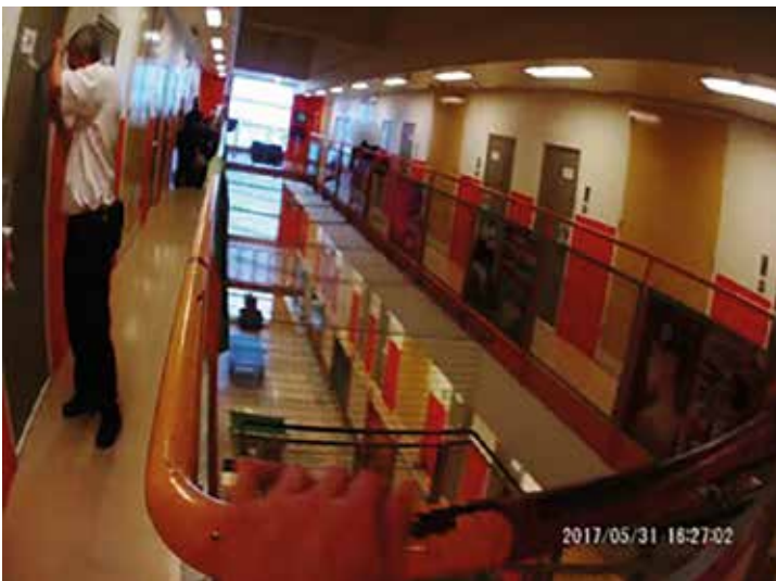
Figure 30: Safety netting at Brook House