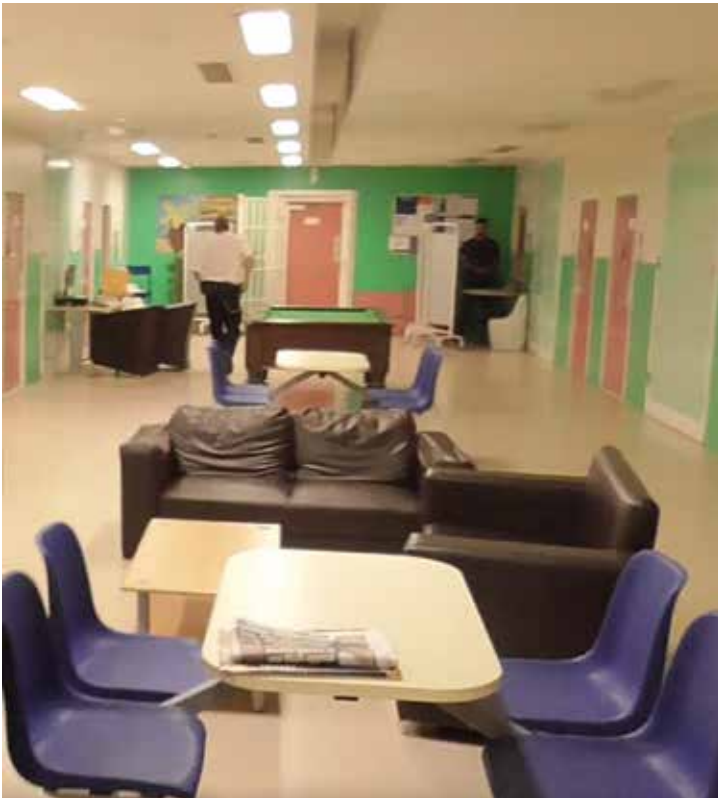
Figure 32: E Wing and entrance to CSU