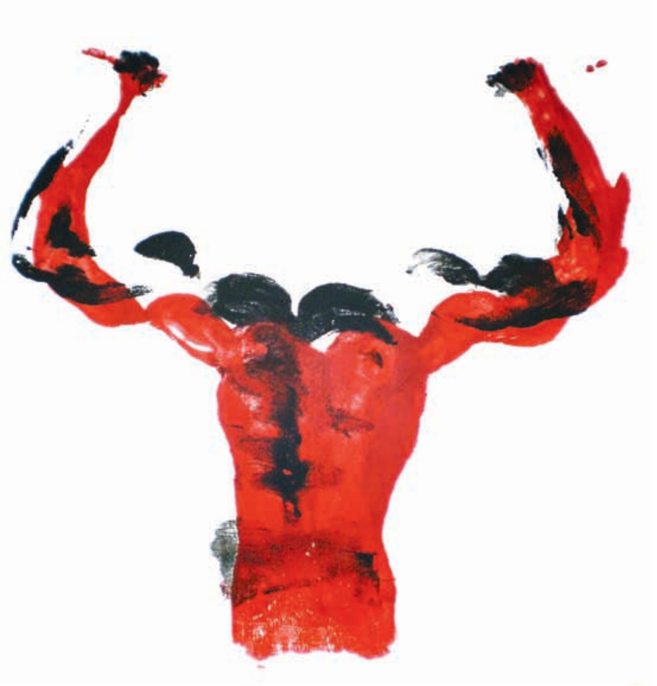
Artwork by Brook House detainee Ridy