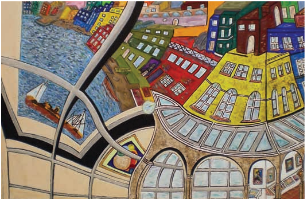
Artwork by former detainee Ruben

GDWG obtained informed consent from all participants in the research to use their data anonymously.